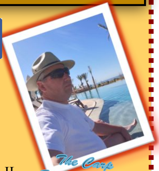
The Carp Editor in Chief